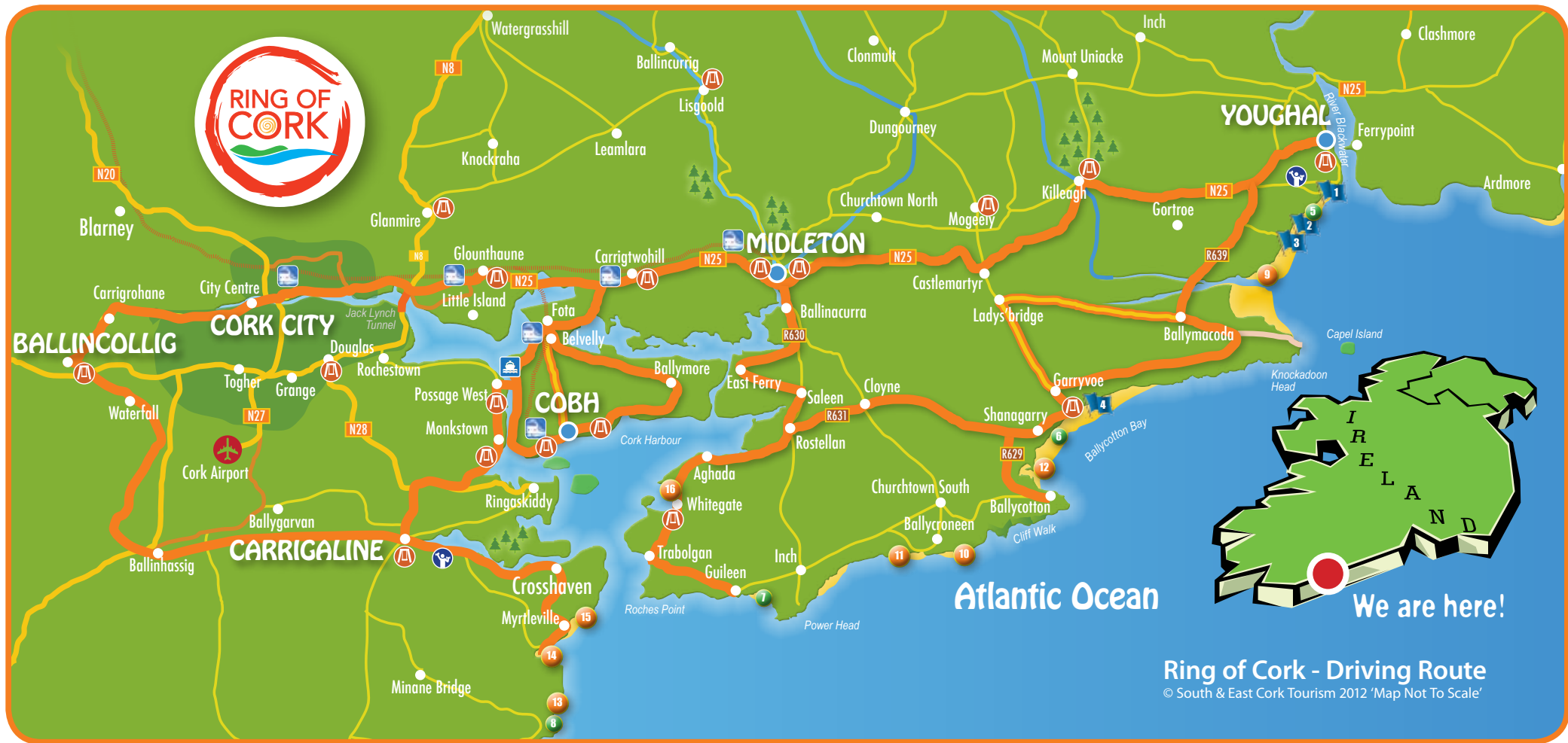
Ring of Cork - Driving Route © South & East Cork Tourism 2012 'Map Not To Scale'