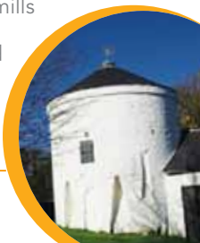
Royal Gunpowder Mills