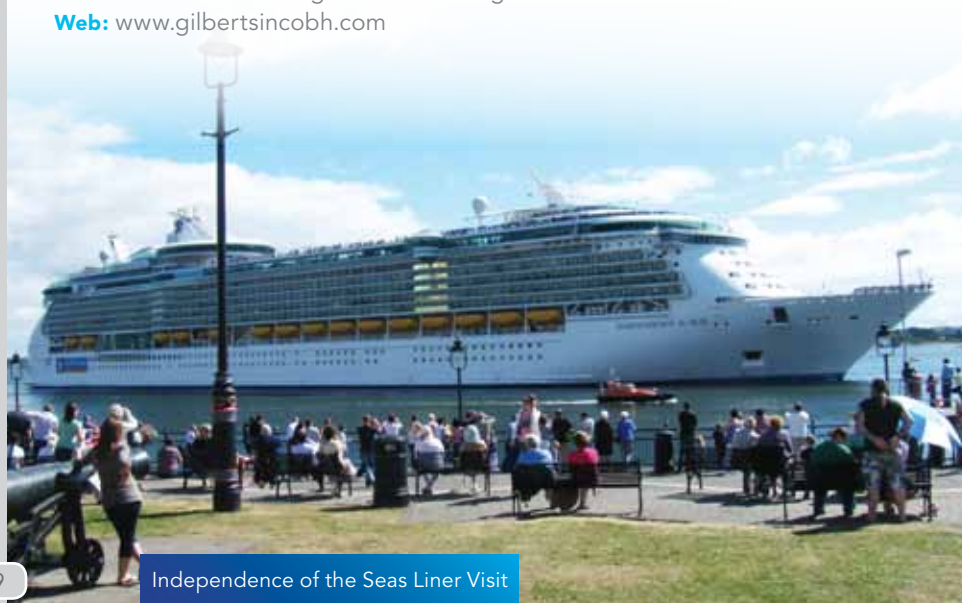
Independence of the Seas Liner Visit