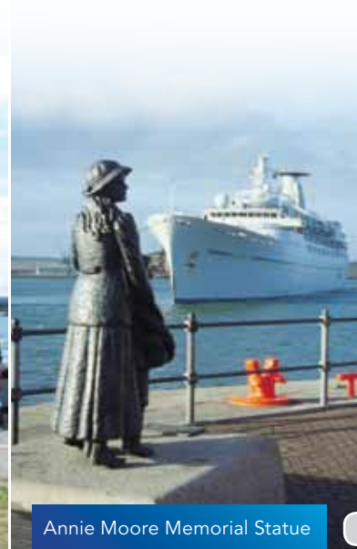
Annie Moore Memorial Statue