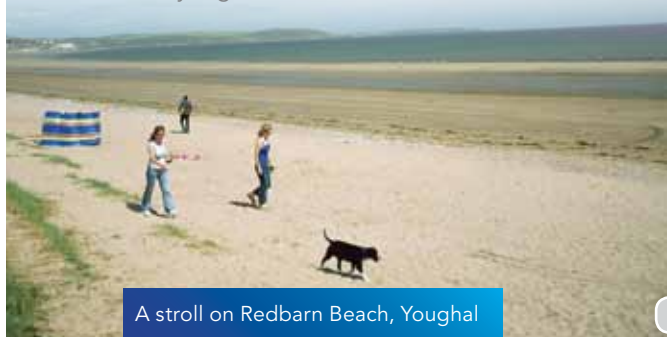
A stroll on Redbarn Beach, Youghal