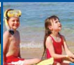
9 Blue Flag Beaches