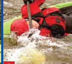
5 Adventure Sports