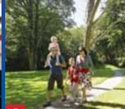
4 Gardens & Walks