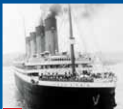
7 Titanic Adventures