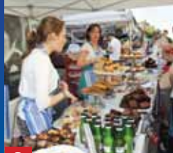
3 Food & Drink