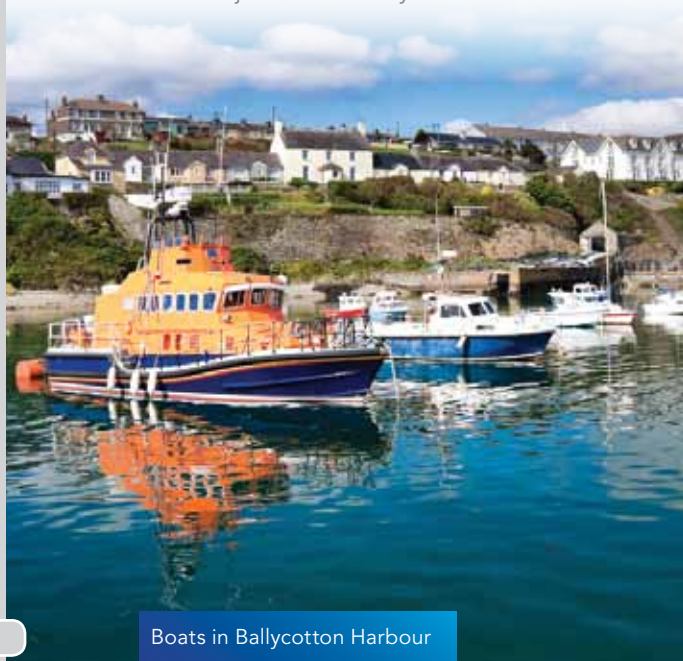
Boats in Ballycotton Harbour