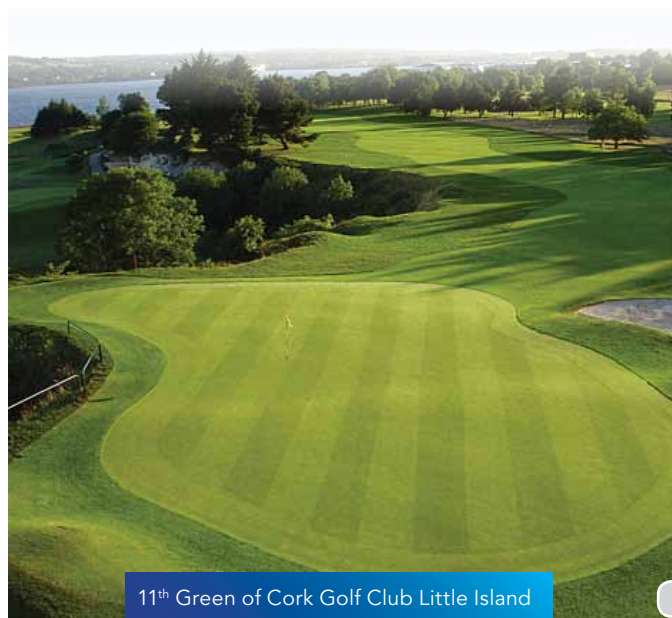
11 th Green of Cork Golf Club Little Island