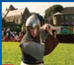
8 Events & Festivals