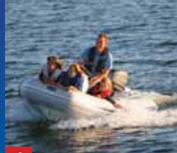
1 Fun for All Ages